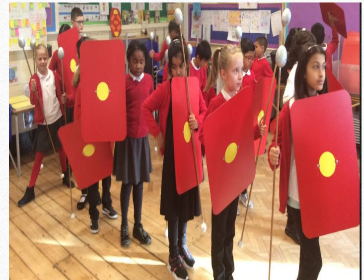
These are some photos from the exciting things pupils learnt about on the Roman Day.