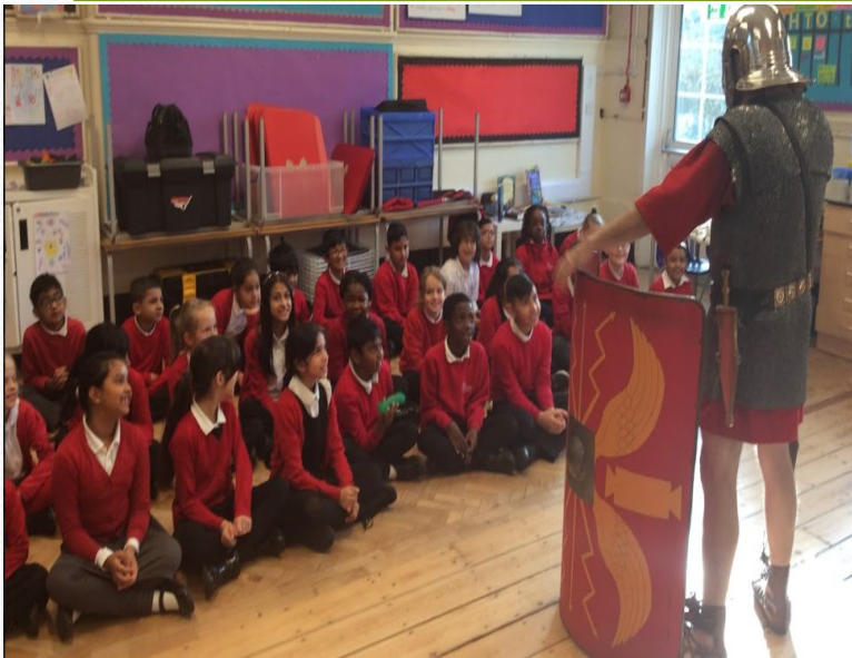
Roman Day Unit: Romans